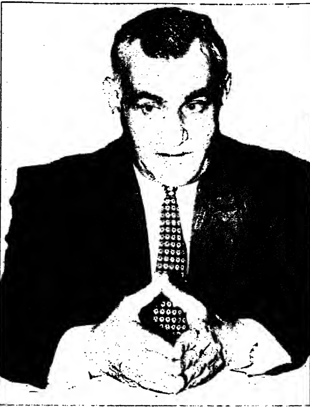
Mordechai may have to explain Israel's military trade with China.

rocket fell on a nearby town, killing many civilians. But the toughest questions for Mordechai might come from Congress. Many in the Republican-controlled House of Representatives and Senate are furious over the failure of the Clinton administration to punish China for what they say are Beijing's violations of US missile proliferation statutes.